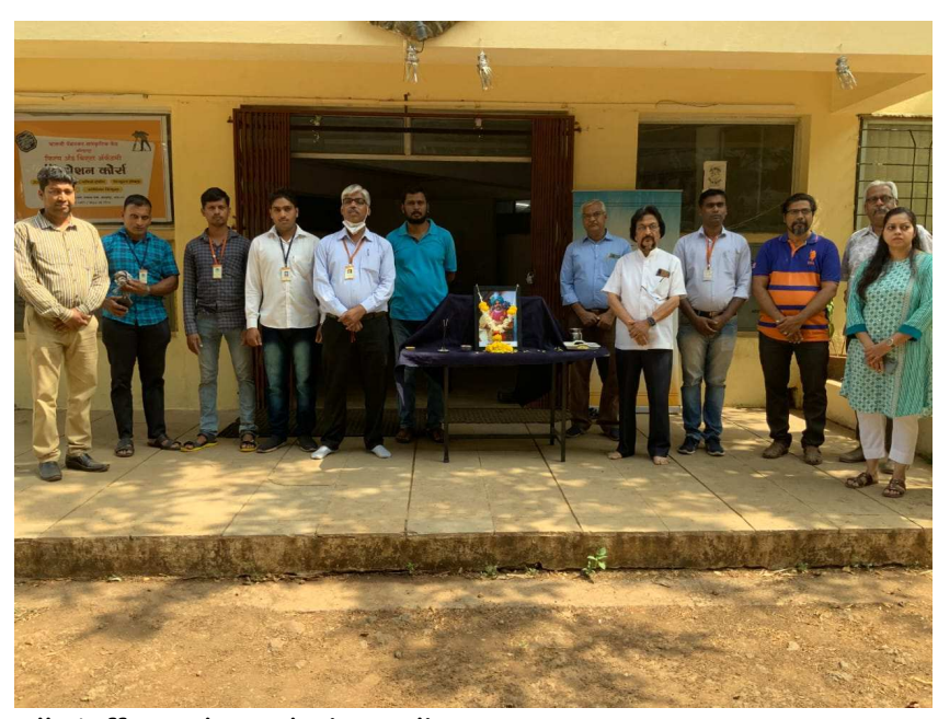
all staff members during salience programme