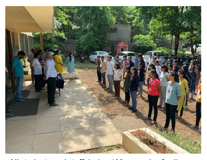
All students and staff during 100 seconds of salience